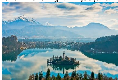
Picturesque Alpine Lake of Bled

Vintgar gorge – Bled lake – Bled castle – Bohinj lake – lunch – overnight in Ljubljana