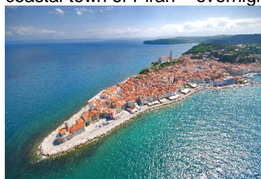
Town of Piran on Adriatic coast

Skocjan caves – lunch in Karst tavern – stud farm Lipica – coastal town of Piran – overnight in Ljubljana