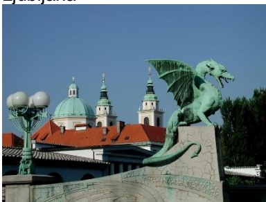
Dragon city – Ljubljana

Arrival to hotel – Food & Wine city walk – overnight in Ljubljana