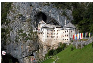
Medieval Predjama castle

Postojna cave – Predjama castle – beer tasting and lunch – overnight in Ljubljana